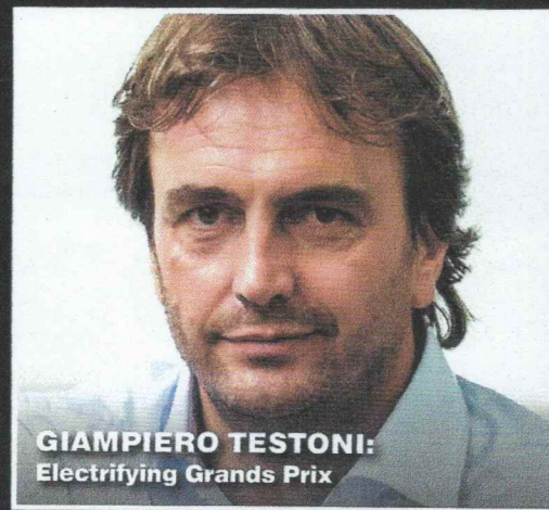
GIAMPIERO TESTONI: Electrifying Grands Prix

THE COMMUNICATIONS HUB OF THE RACING POWERTRAIN WORLD