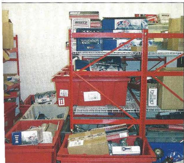
...ponents needed for a rebuild are identified with the ...s balance number.

Gaerte sells more than 500 dyno-tested carburetors a ... as well as gear drives, camshafts, valve springs and ...r components. The company is a performance ware- ...e for many top manufacturers, offering its services to